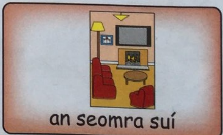
an seomra súi