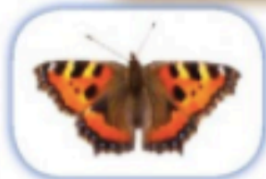
Small Tortoiseshell (size: 50 mm)