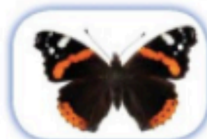
Red Admiral (size: 65 mm)